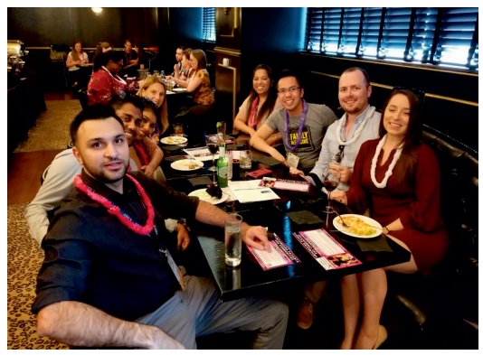
The Friday evening reception was the perfect place to catch up and wind down after a busy day.