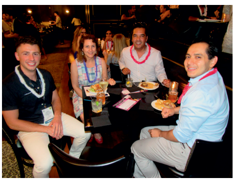
Red = resident, white = student, purple = faculty at the Illinois reception!