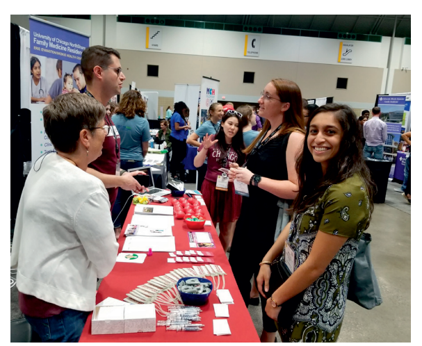
Opening day in the exhibit hall where Illinois had 24 booths!